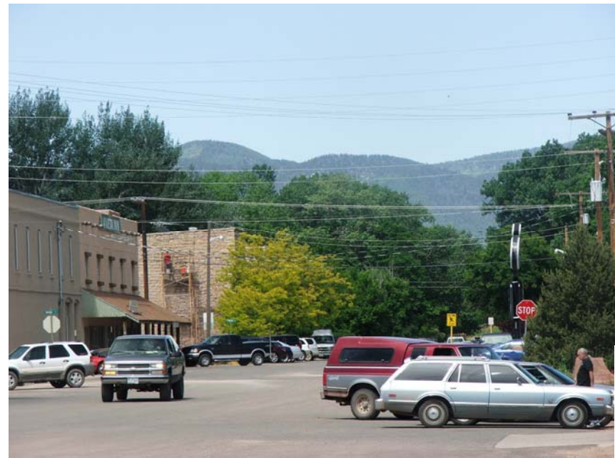
La Veta, CO